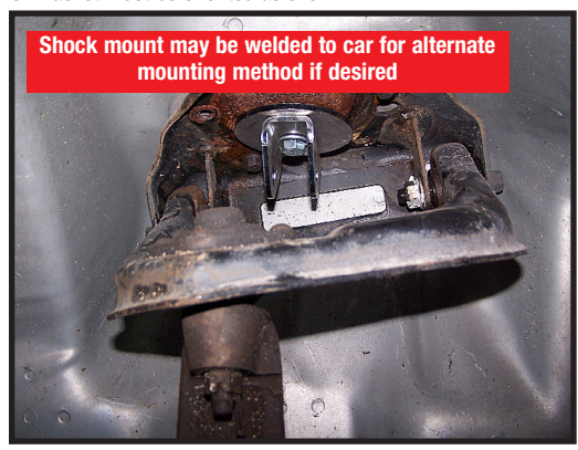
5. Bracket must be oriented as shown