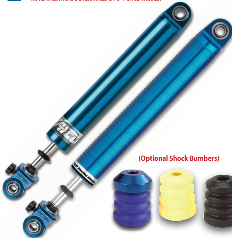
(Optional Shock Bumpers)

Get your copy of the NEW AFCO Circle Track Catalog & Tech Guide featuring over 30 pages of Shocks & detailed chassis tuning guides!