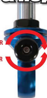
Rod End Rebound Knob

The adjusters on these shocks are specifically designed to make fast, precise, and repeatable changes. The knobs are 100% o-ring sealed from the elements and easy to grasp, even with muddy, greasy, or gloved hands. The easy-to-feel, spring-loaded detents allow you to quickly change with a simple click.