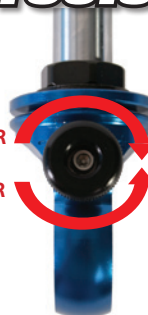
Rod End Rebound Knob