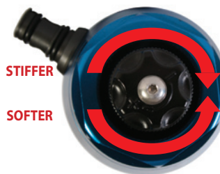
Canister Compression Knob

The adjusters on these shocks are specifically designed to make fast, precise, and repeatable changes. The knobs are 100% o-ring sealed from the elements and easy to grasp, even with muddy, greasy, or gloved hands. The easy-to-feel, spring-loaded detents allow you to quickly change with a simple click .