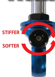
Rod End Rebound Knob