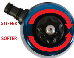
Canister Compression Knob

The adjusters on these shocks are specifically designed to make fast, precise, and repeatable changes. The knobs are 100% o-ring sealed from the elements and easy to grasp, even with muddy, greasy, or gloved hands. The easy-to-feel, spring-loaded detents allow you to quickly change with a simple click.